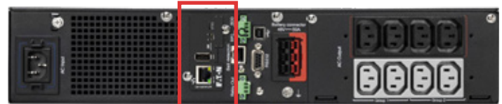
Eaton Gigabit Network Card installed in a UPS

For more information, please visit: Eaton.com/Network-M3